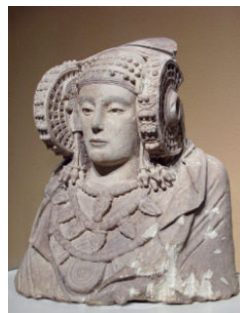
The Lady of Elche (currently at the Spanish National Archeological Museum – Madrid)

period, it is worth pointing out a remarkable sculpture assembly including masterpieces like the Lady of Elche ( Dama de Elche ) and the Warrior Bust ( torso del guerrero ), and the decorative ceramics with the so-called Elche style. In the Roman period, Elche became Colonia Iulia Ilici Augusta , one of the most outstanding cities on the Spanish Mediterranean coast.